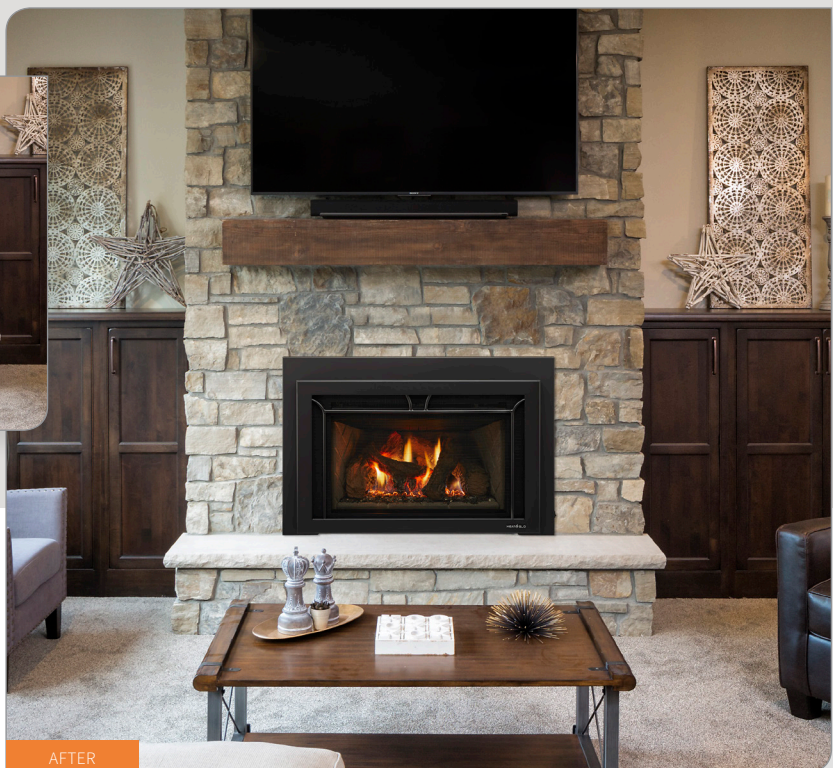
Shown: Supreme gas fireplace insert by Heat & Glo